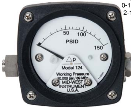
Model 124 0-150 PSID 2-1/2" Dial

A low cost differential pressure gauge for use in measuring the pressure drop across filters, strainers, separators, valves, pumps, chillers, etc., and for local flow indication and control.