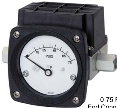
Model 124 0-75 PSID Shown with End Connections & Transmitter

Due to precision sizing of piston and body bore, leakage across piston will not exceed 15 SCFH air at 100 PSID at ambient temperature.