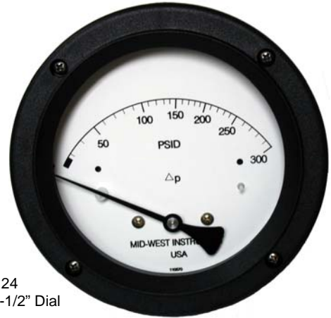
Model 124 0-300 PSID 4-1/2" Dial

An optional maximum indication follower pointer provides automatic indication of maximum differential occurring during a time period or system cycle. Reversed pressure ports are optionally available to facilitate installation and readability depending on which side of a filter, etc., the instrument must be installed.