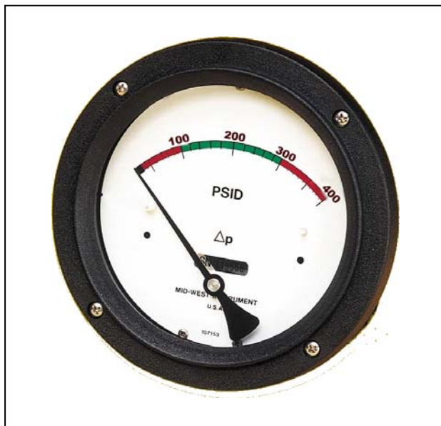
4 1/2" Dial