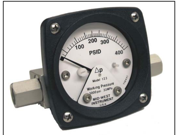
2 1/2" Dial