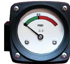
Shown with special option color dial

NOTE: Reverse pressure should be avoided.