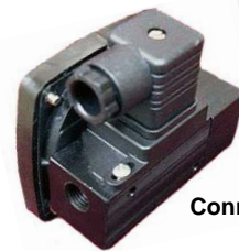
DIN Connector Shown

NOTE: Reverse pressure should be avoided.