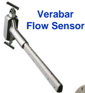
Verabar Flow Sensor