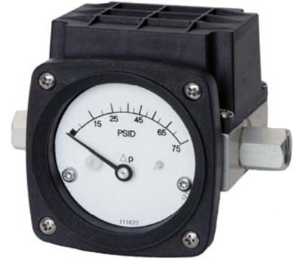
Model 121 0-75 PSID 2-1/2” Dial. Shown with End Connections & Transmitter

Transmitter now CSA Listed for Division 2 Hazardous Location Service 1