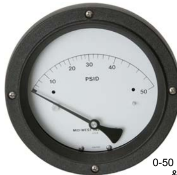
Model 121 0-50 PSID 4-1/2” Dial & Transmitter