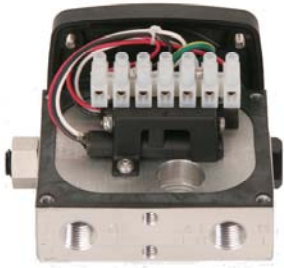
Open back view Model 121 reed switch with terminal strip