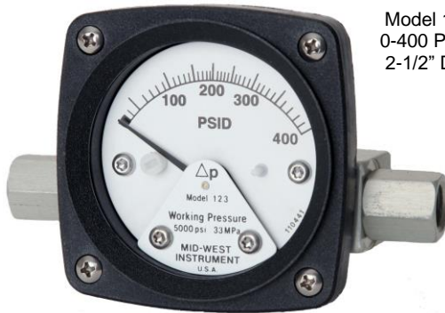
Model 123 0-400 PSID 2-1/2" Dial

A low cost differential pressure gauge for use in measuring the pressure drop across filters, strainers, separators, valves, pumps, chillers, etc., and for local flow indication and control.