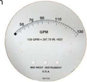
0-130 GPM Flow Gauge Scale

Common Applications: Tank Level Monitoring Horizontal or Vertical Flow, Liquid Level, Indication/Balancing, Filter Monitoring for Gases, Water Treatment Applications and Vacuum Application