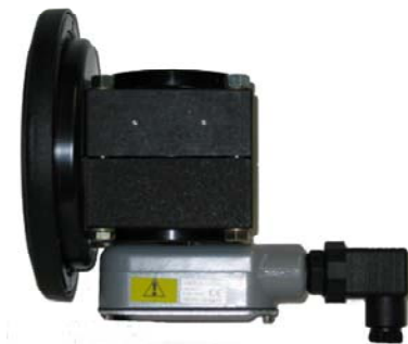
Shown w/Aluminum Body & (1) Reed Switch with Condulet enclosure and Plug-In Connector (Din 46350-PG 11)

CSA listed control switching is available in an explosion-proof enclosure which complies with NEC Class I, Groups C and D; Class II Groups E, F, and G; NEMA 7 and 9 standards. These are machined cast-aluminum enclosures with 1/2" FNPT conduit connection and 24" wire leads.