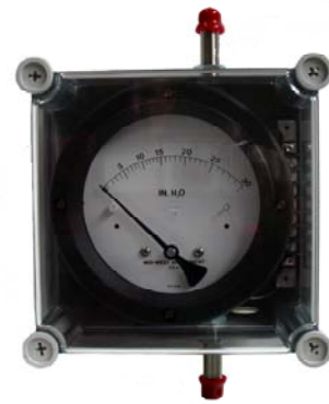
Shown in NEMA 4X Plastic enclosures

Factory preset switch at no extra charge (Specify Setting) Specify increasing or decreasing range to be set.