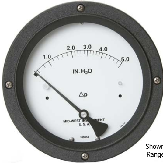
Shown here with Range 0-5" H 2 O

Model 130 is a rugged general purpose differential pressure gauge with a 4-1/2" round dial.