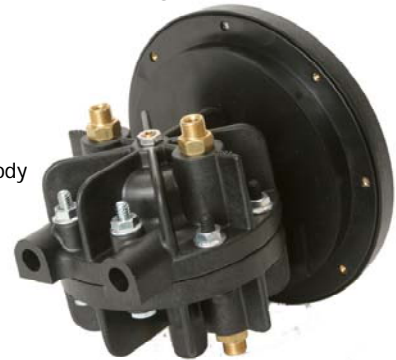
Shown with Engineered Plastic Body