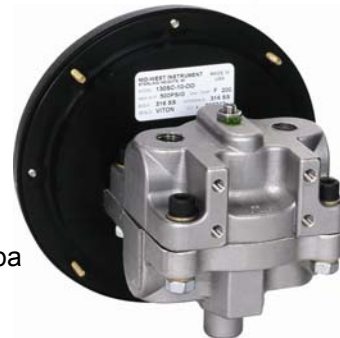
Shown with S.S. Cast Body