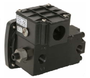
Model 142 shown with "AA" switch option (1) Reed switch located inside NEMA 4x enclosure with 7 position terminal strip. An opening at rear of enclosure accepts ½" flexible weather-proof or conduit connector (supplied by customer).

Model 142 "Delta Meter" is available with either one or two hermetically sealed reed switches for either high alarm, low alarm, or both and a 4-20mA transmitter depending on model. The switches are Single Pole Double Throw (SPDT) or Single Pole Single Throw (SPST) with adjustable set points. Switch can be set to activate/deactivate on rising or falling pressure. CE Marked & ROHS Compliant