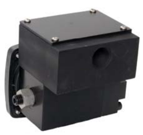
Model 142 shown with "TT" switch option. (1) 4-20 mA Transmitter (8-28 VDC Loop Power) with 7 position terminal strip. An opening at rear of enclosure accepts ½" flexible weather-proof or conduit connector (supplied by customer).