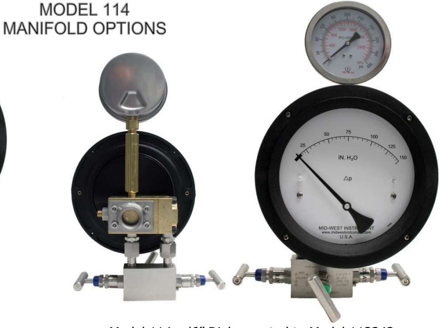
Model 114 w/6" Dial mounted to Model 113343 3-Valve Mini-Manifold 1/4" FNPT Process connections Show with optional stand-off & pressure gauge