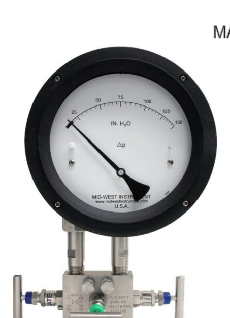
Model#114 6" Dial mounted to Model 107470 3-Valve Manifold 1/2" FNPT Process connections

You have an Elastomer Seal and Diaphragm choice of Buna-N, Viton or Ethylene Propylene. Dial sizes available are 2-1/2", 4-1/2" or 6" diameter with black lettering on a white dial.