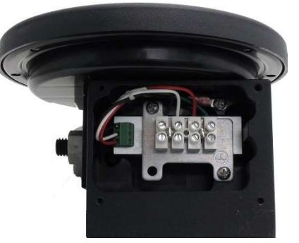
Shown on Aluminum Body