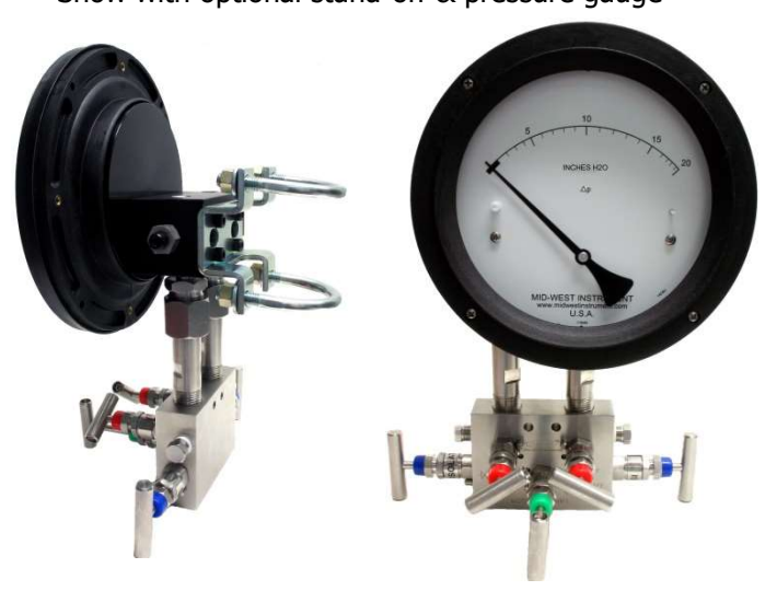
Model 114 w/6" Dial mounted to Model 107469 5-Valve Manifold With optional 2" pipe mount 1/2" FNPT Process connections

Model 114 can be direct mounted to anyone of 4 different manifolds. See Bulletin MFLD/18 For more Information