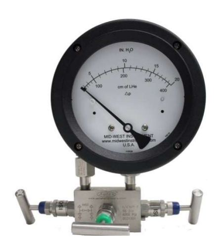
Model 114 w/4-1/2" Dial mounted to Model 113343 3-Valve Mini-Manifold 1/4" FNPT Process connections