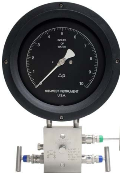
Model 115 shown with Optional model 107467 S.S. Direct Mount 3-Valve manifold with pressure gauge port

Model 116 can be equipped with one or two independently adjustable SPDT snap acting Micro-Switches which can be set on decreasing or on increasing pressure. A switch adjustment screw and a switch lock screw is accessible after removal of the lens and bezel (removal of 4 screws). Interface to the snap acting micro-switch is via color coded 18 AWG flying leads and a ½’ FNPT conduit connection. Model 116 with switch temperature limits are rated at -20°C to +185°F