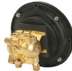
Model 116 Cast Brass Body