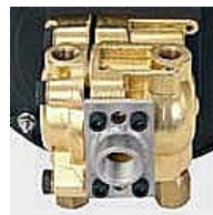
Optional 3/4" FNPT Stub Mount Shown Shown on Model 116