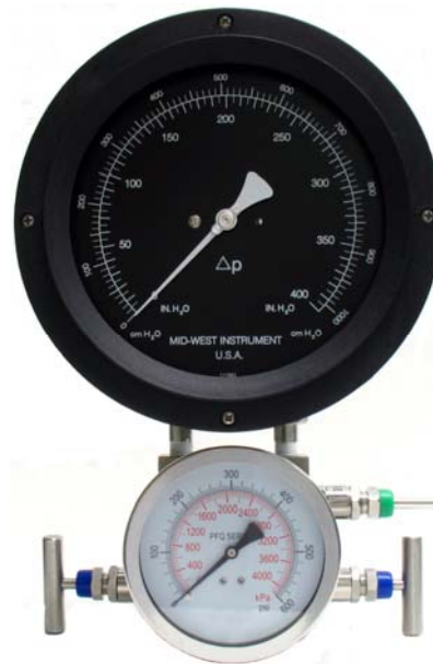
Model 116 shown with Optional model 107467 S.S. Direct Mount 3-Valve manifold with (Customer supplied) pressure gauge