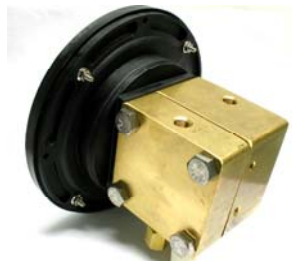
Model 115 Brass Body