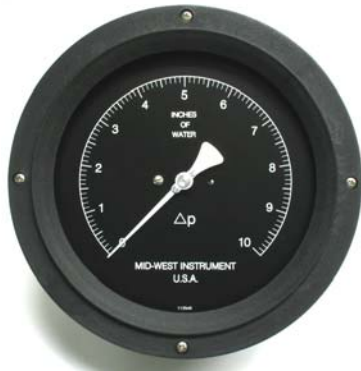
0-10" H 2 O Single Scale