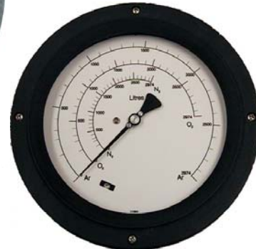
Ar, O 2 , N 2 Tri-Scale Dial