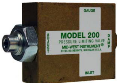
Brass Model 200