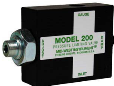
Aluminum Model 200